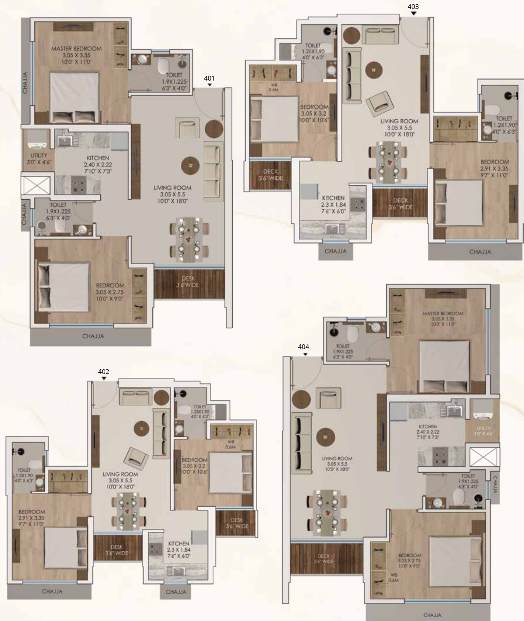
2 BHK Plan